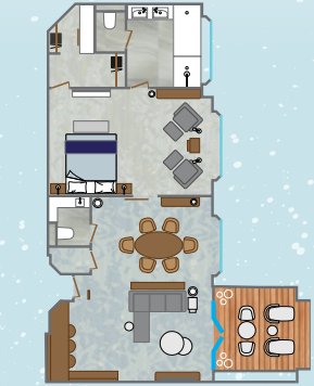
OWNER'S SUITE, MIDSHIP