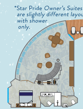
OWNER'S SUITE, FORWARD*

*Star Pride Owner's Suites are slightly different layout with shower only.