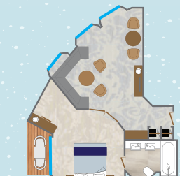
CLASSIC SUITE/ BROADMOOR SUITE / SEA ISLAND SUITE

*Star Pride Owner's Suites are slightly different layout with shower only.