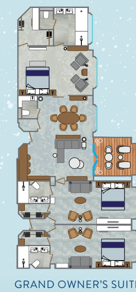
GRAND OWNER'S SUITE